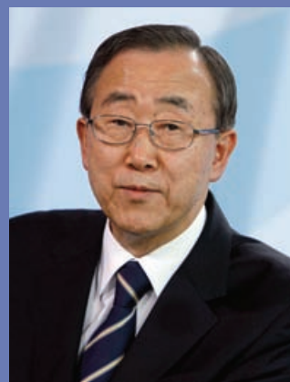
Ban Ki-moon United Nations Secretary-General

“When we work together, we succeed” – Women Deliver, June 2010